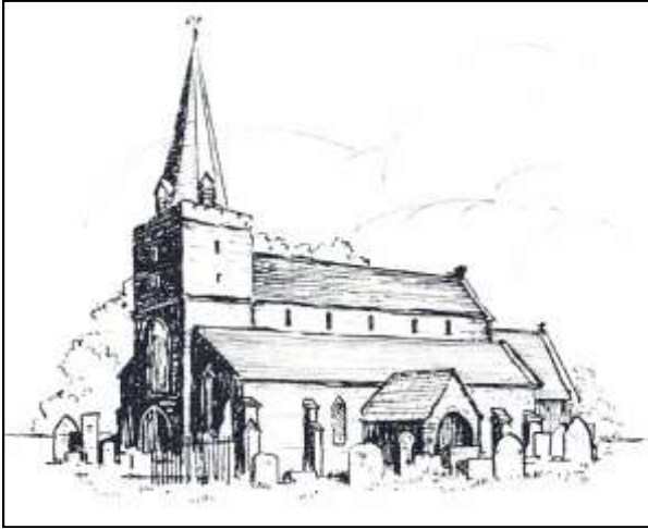
St. Nicholas, Trellech