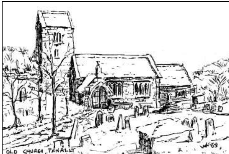
Old Church, Penallt

FREE to all houses in the parish, but donations towards printing costs are always welcome! Please call the Treasurer on 01600-860122 for information on how to make a donation. Thank you.