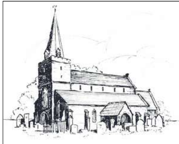
St. Nicholas, Trellech

Easter Greetings to everyone in the parish