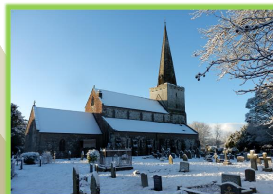
St Nicholas - Trellech